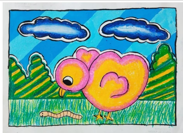
VANSHIKA PARMAR: V-K