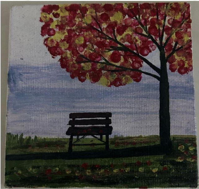
PRABIR BHAGIA: IV-B