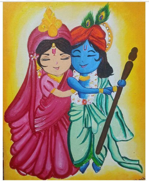
VANSHIKA PARMAR: V-K