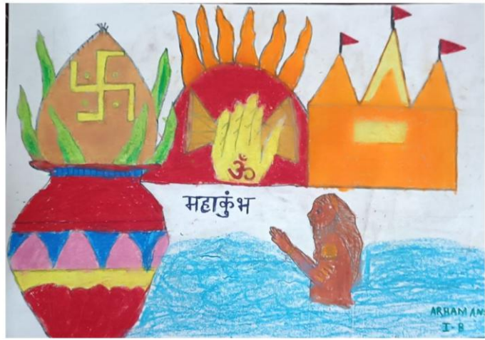
ARHAM ANSARI: I-B