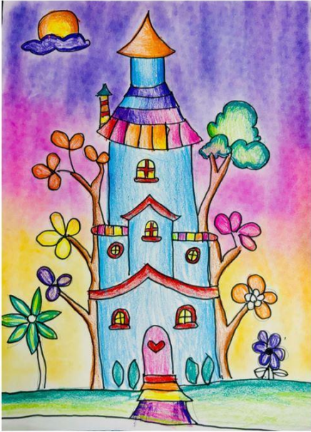
VEER SAIKIA: I-A