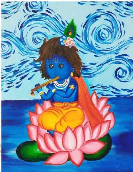
DEVANSHI PARMAR: V-K