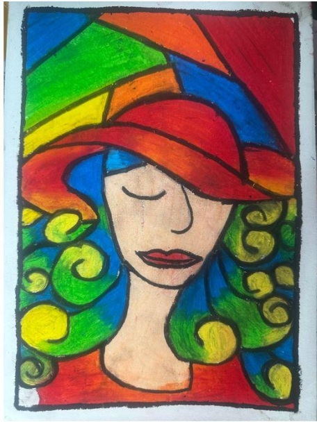
MAYSHA SHAH: V-C