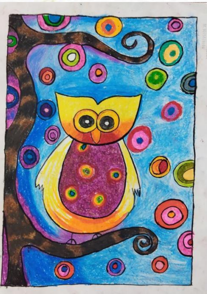
VANSHIKA PARMAR: V-K