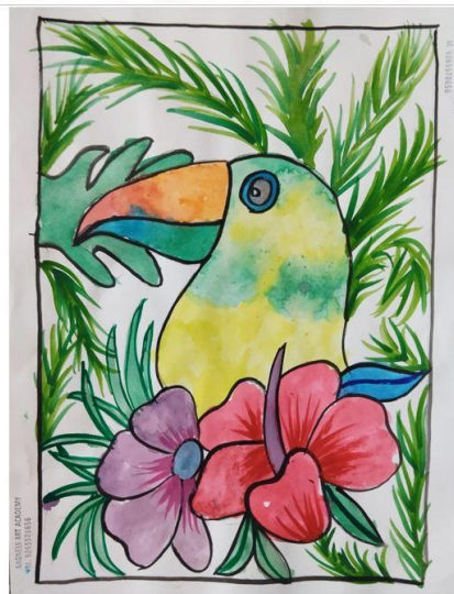
DEVANSHI PARMAR: V-K