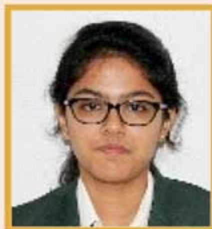
Anushka Reddi Fine Arts