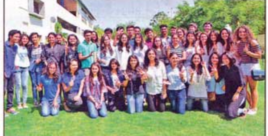
વિદ્યાર્થી અભ્યાસમાં ખૂબ જ વાંચિવારે હોય તેમ છતાં પરિણામ સારું આવે છે તેવામાં ઘણાં માટે નો ટેન્શનમાં આવી જતાં હોય છે. જોકે, આ પરિણામ આવે અને તેમાં પણ અપેક્ષા પુરુષણના પાર્શ્વે આવે તો વિદ્યાર્થીઓના માથા પરથી જાણે મળતો બાર ઉતરે છે અને ખુશીની કોઈ કિમ્મત રહેતી નથી. સેન્ટ્રલ બોર્ડ ઓફ સેકન્ડરી એજ્યુકેશન (સીબીએસસી) બોર્ડ દ્વારા લેવામાં આવેલી ધોરણ-12ની પરીક્ષાનું પરિણામ રવિવારે જાહેર કરવામાં આવ્યું હતું. જેમાં અમદાવાદની મોટાભાગની સ્કૂલોએ 100% પરિણામ મેળવ્યું હતું. અમદાવાદના અનેક વિદ્યાર્થીઓ અનુક્રમિક રીતે 100માંથી 100 માંક સાધવામાં સક્ષમ રહ્યા છે. સમગ્ર દેશનું પરિણામ ભલે 82.02 ટકા આપ્યું હોય પરંતુ અમદાવાદના વિદ્યાર્થીઓએ ધોરણ-12માં ખૂબ જ અદ્ભુત પ્રદર્શન કર્યું છે. આ પરિણામને પગલે વિદ્યાર્થીઓમાં સ્વ ખુશીનું વાતાવરણ ઘડી ગયું છે.

સેન્ટ્રલ બોર્ડ ઓફ સેકન્ડરી એજ્યુકેશન (સીબીએસસી) બોર્ડ દ્વારા લેવામાં આવેલી ધોરણ-12ની પરીક્ષાનું પરિણામ રવિવારે જાહેર કરવામાં આવ્યું હતું. જેમાં અમદાવાદની મોટાભાગની સ્કૂલોએ 100% પરિણામ મેળવ્યું હતું. અમદાવાદના અનેક વિદ્યાર્થીઓ અનુક્રમિક રીતે 100માંથી 100 માંક સાધવામાં સક્ષમ રહ્યા છે. સમગ્ર દેશનું પરિણામ ભલે 82.02 ટકા આપ્યું હોય પરંતુ અમદાવાદના વિદ્યાર્થીઓએ ધોરણ-12માં ખૂબ જ અદ્ભુત પ્રદર્શન કર્યું છે. આ પરિણામને પગલે વિદ્યાર્થીઓમાં સ્વ ખુશીનું વાતાવરણ ઘડી ગયું છે.