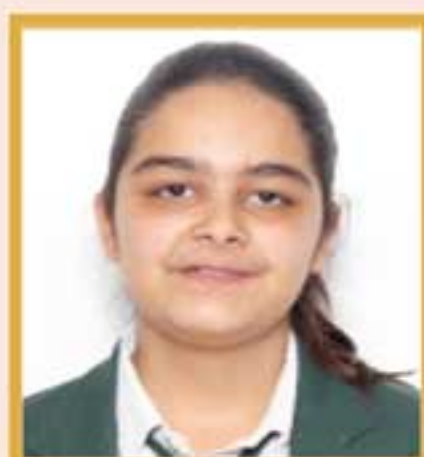
Vanya Bhatia Fine Arts