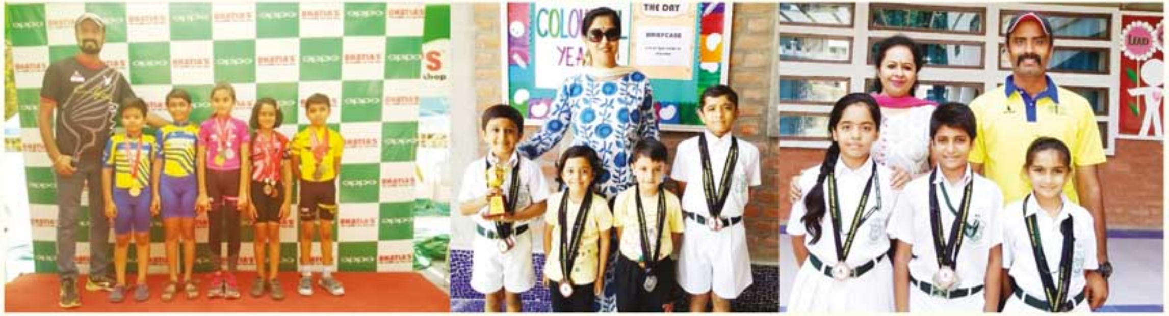
1 st Rank One Skating Championship 2017