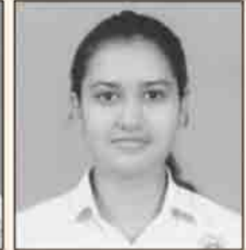
Moksha Gandhi Fine Arts 100/100